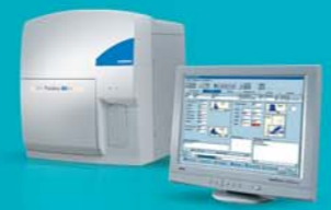
ABX Pentra 60 C+