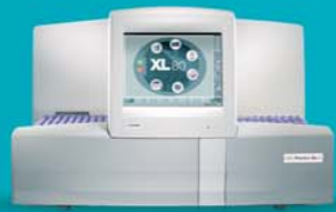
ABX Pentra XL80