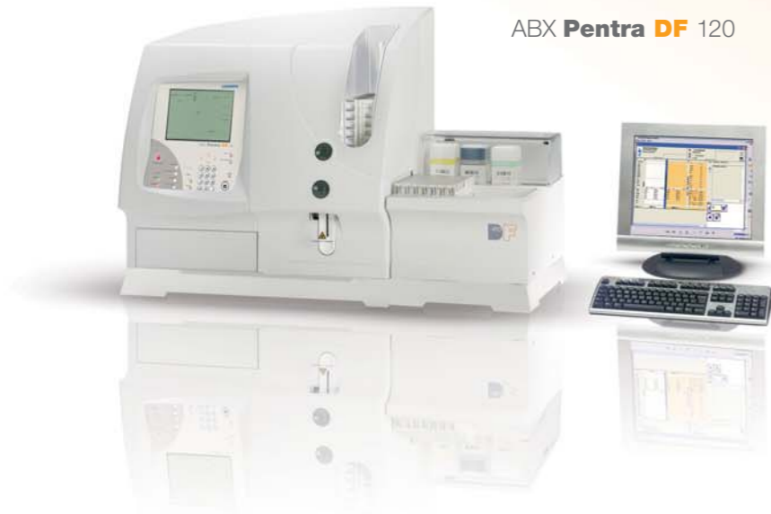
ABX Pentra DF 120