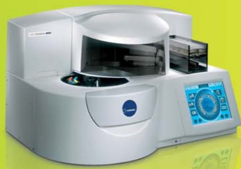
ABX Pentra 400