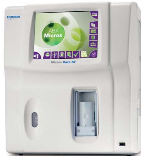
ABX Micros Care ST