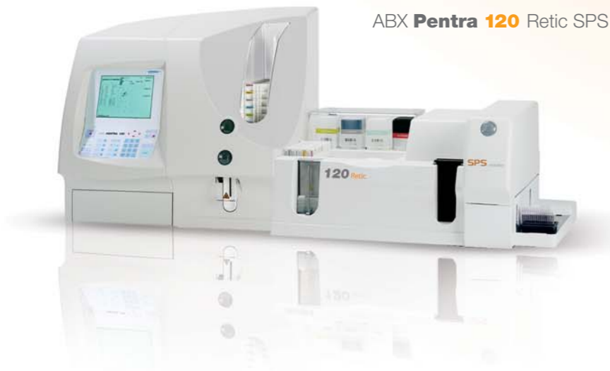
ABX Pentra 120 Retic SPS