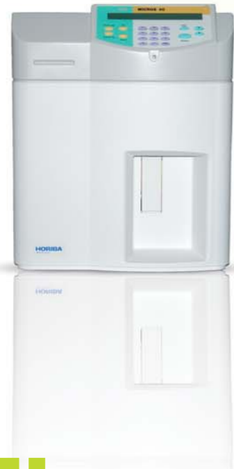
ABX Micros 60