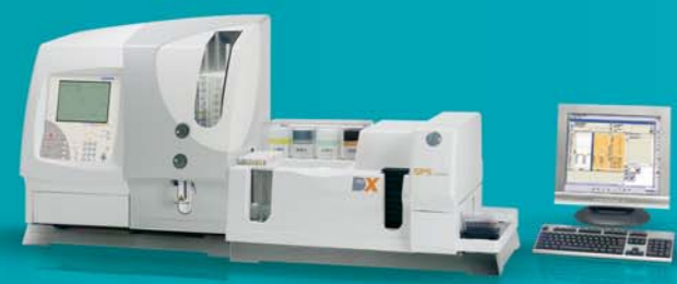
ABX Pentra DX 120 SPS Evolution