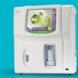
ABX Micros ES 60