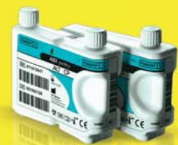
ABX Pentra liquid reagents