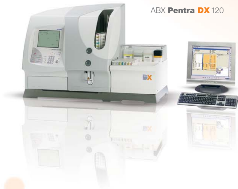
ABX Pentra DX 120

120 tests/hour 49 parameters Expert validation system (ABX PENTRA ML)