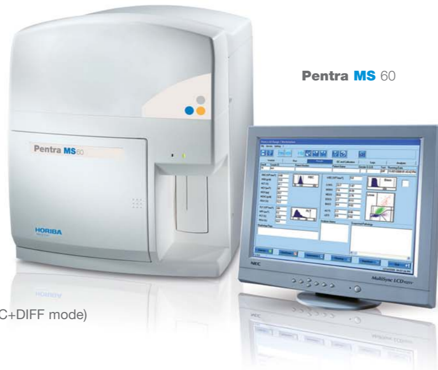
Pentra MS 60

NEW Micro-sampling on whole blood (18 µL in CBC mode, 28,5 µL in CBC+DIFF mode)