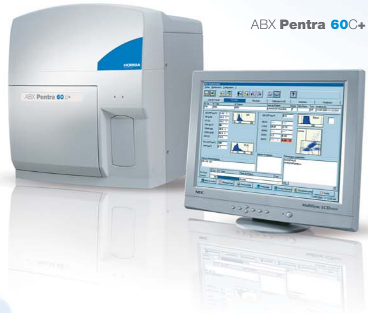
ABX Pentra 60 C+