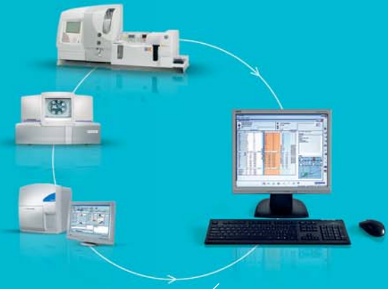
ABX Pentra ML