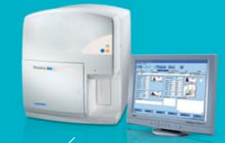
Pentra MS 60