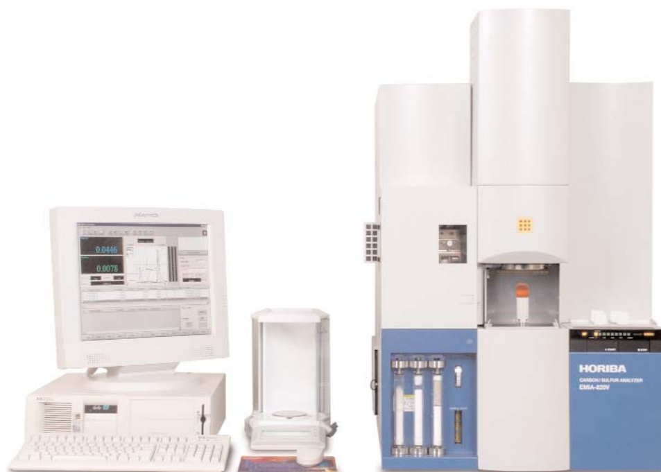
Figure 1: EMIA 820V

The high frequency or induction furnace is equipped with a plate current control function. This allows users to easily optimize the temperature according to the samples. Some customized temperature curves can be created in order to observe various phenomena such as surface contamination and different phases or forms of carbon and sulfur.