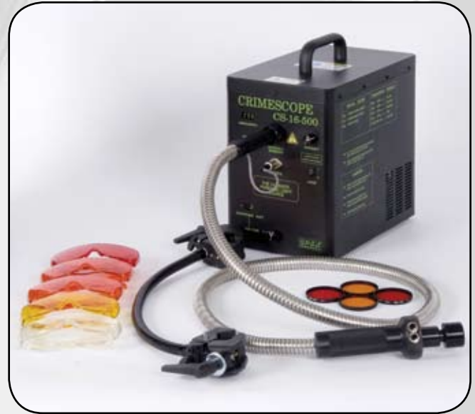
The one and only CrimeScope®.

Fingerprints (porous/non porous surfaces), body fluids, trace evidence, bite marks and bruises, shoeprints, gun shot residues, bone fragments, drugs, etc.