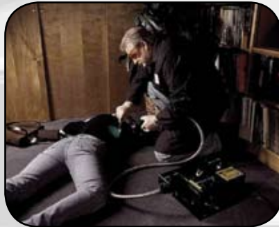
Designed for portability.

The Mini-CrimeScope® has been among the most powerful Forensic Light Sources for some time.