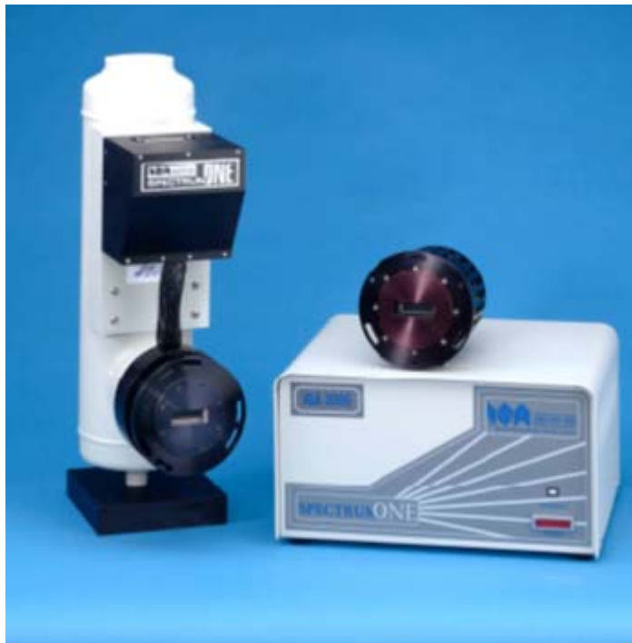
IGA-3000 array detectors

These versatile array detectors are available in liquid nitrogen (LN 2 ) and compact thermoelectrically cooled (TE) packages and are completely controlled by our compact IEEE488 based controller.