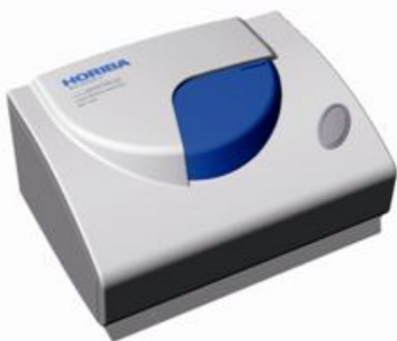
Figure 1: SZ-100 Nanoparticle Analyzer.

Using the SZ-100 Nanoparticle Analyzer the concentration of additive needed to reduce the zeta potential of wastewater suspended solids to zero can be reliably evaluated and so the efficiency of different additives can be readily compared such that the most economical option can be chosen. Particulate aggregation is typically achieved through the use of additives: coagulants (inorganic) and flocculants (polymeric). In this note, the effect of coagulant choice and concentration on the treatment of suspended clays is analyzed.