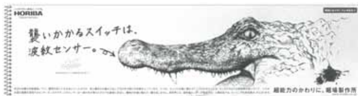
Published July 25, 2011