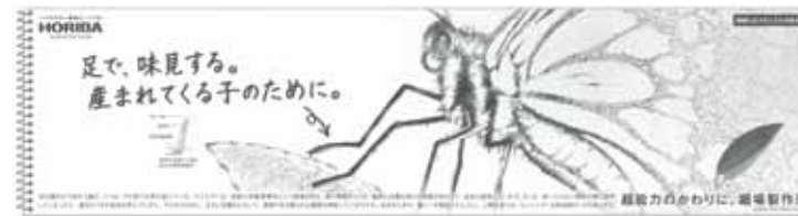
Published September 26, 2011