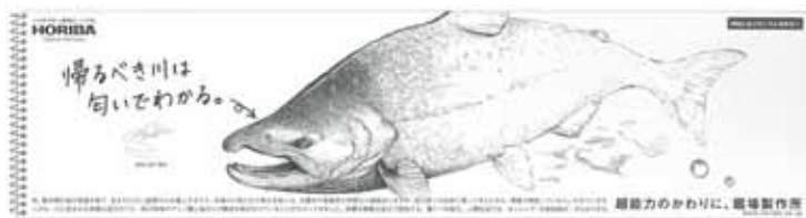
Published November 29, 2010

HORIBA's corporate advertisement, entitled "HORIBA, Ltd. believes that mystery has a mechanism—one that is not supernatural in nature," was published in the Nikkei Sangyo Shimbun from November 2010 to September 2011.