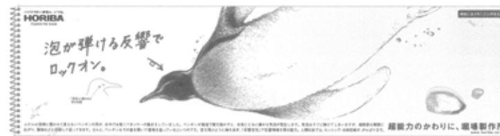
Published January 26, 2011