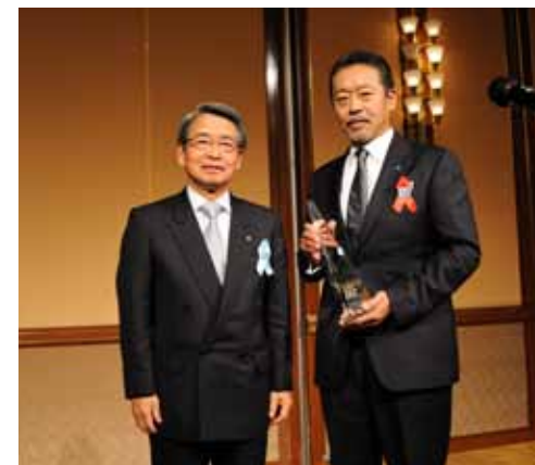
Award ceremony at which the Best IR Award was presented

For the first time, HORIBA was named as a winner of the “Best IR Award” in a competition for excellence in IR activities organized by the Japan Investor Relations Association. The selection of winners out of 304 companies that had applied to participate in the competition was based on a questionnaire survey of stock analysts and investors and a review by a screening panel. We will continue to further refine our strengths which were evaluated highly by the judges (e.g., proactive participation in IR activities by top management, clear presentations and easy-to-understand annual reports), thereby carrying out effective IR activities to accurately communicate HORIBA’s corporate culture to our stakeholders.