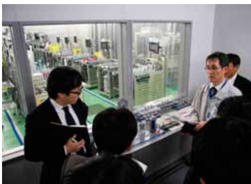
Aso factory (Kumamoto Prefecture) tour (December 20, 2011)