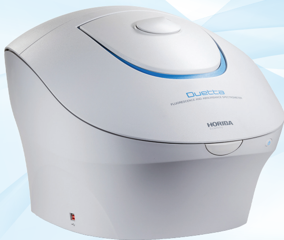
Figure 1: Duetta, a 2-in-1 fluorescence and absorbance spectrometer