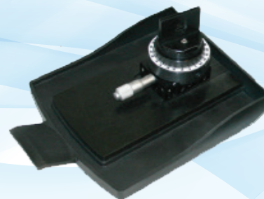
Figure 2: SampleSnap-UNI solid sample holder for Duetta. This rotating stage holds thin films, slides, and other solid samples. Other attachments are available for powders and cuvettes for front-face measurements. Attachment shown is the SampleSnap-SS for holding slid samples such as glass, slides and films.

Neodymium laser glass was purchased from Schott Glass North America. The glass was excited with 575 nm light and the emission spectra detected on both a standard PMT-based fluorimeter and the CCD-based Duetta instrument. All spectra are shown with correction for lamp intensity and instrument correction factors. The piece of laser glass was held at 60 degrees relative to the excitation light path using the SampleSnap-SS solid sample holder on the SampleSnap-UNI variable angle tray.