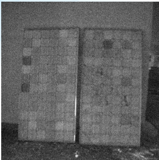
Figure 2: EFIS video frame of a solar panel with variable currents at 20 frames per second. The defective cells are clearly visible. Contrast could be improved using a visible filter.

EMCCD offers higher resolution and a larger field-of-view as compared to a SWIR camera, plus the added benefit of lower cost.