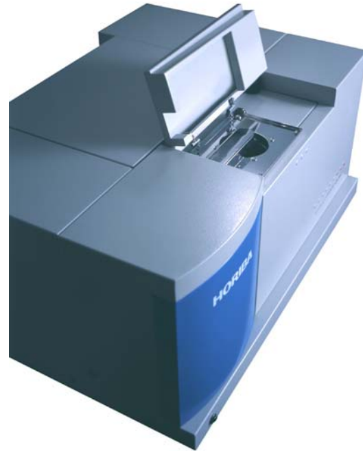
Fig. 2 Horiba LA-930

Particle size of the cocoa powder can be measured after the chocolate liquor has been rendered from the bean at about 100 microns, after the press cake is ground into cocoa powder, and after conching is done, about 18 microns. In addition, The LA-Series instruments can measure the size of the sugar to be added for the conching process. This is important because it is the sugar crystals that help break down the cocoa particles in the conching process.