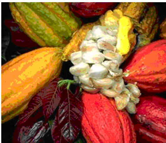
Fig. 1 Cacao tree fruit and seeds

Cocoa trees resemble apple trees except the fruit grows directly on the trunk instead of on the ends of the branches. Each tree is capable of producing 20-30 pods per year. Each pod contains 20-40 seeds. It takes a whole year's production from one tree to yield 450 grams of chocolate.