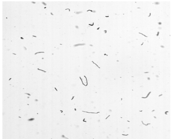
Figure 4: Image of cellulose fibers

The CAMSIZER XT also collects, stores, and presents images of the particles analyzed, allowing for intuitive understanding of particle morphology as seen in Figure 4.