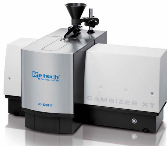
Figure 1: The CAMSIZER XT

Dynamic Image Analysis with the CAMSIZER XT offers a contact free, fast and reproducible alternative (see Figure 1.) The instrument is fully automated, which enables every user to achieve the same result in a much shorter time and with less effort than sieving. Up to 40,000 particles can be analyzed per second, thus after 1 to 3 minutes a statistically sufficient amount of sample has been analyzed. The results are perfectly reproducible and identical to the sieve data due to the advanced sieve correlation algorithm in the CAMSIZER software.