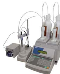
Figure 2: Autotitrator accessory for the SZ-100

The automation of isoelectric point measurement is achieved with the HORIBA Autotitrator accessory for the