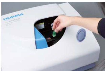
Figure 1: SZ-100 Nanoparticle Analyzer

Zeta potential is the charge on a particle at the shear plane. This value of surface charge is useful for understanding and predicting interactions between particles in suspension. A large magnitude (either positive or negative), that is, over about 25 mV, zeta potential is generally considered an indication that the particle suspension will be electrostatically stabilized. Zeta potential can be measured with the HORIBA SZ-100-Z shown in Figure 1.