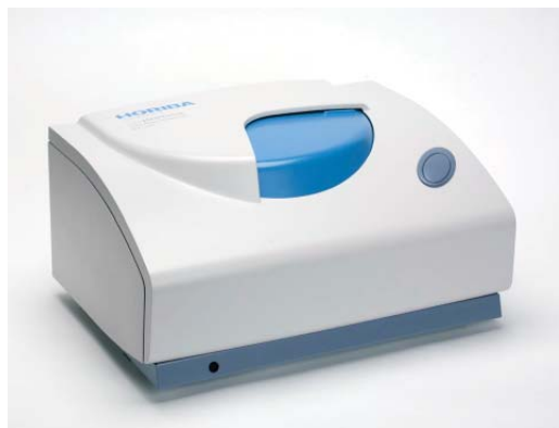
Figure 2: SZ-100 Nanoparticle Analyzer.