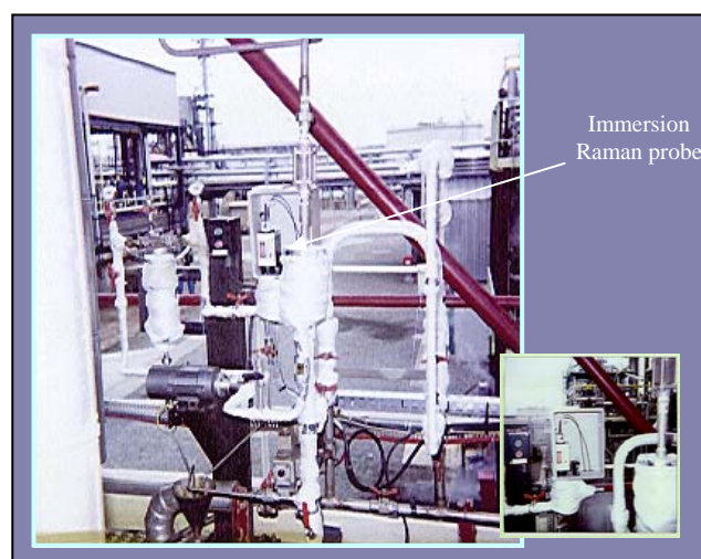
Figure 1 : Experimental set up at the plant

A remote Raman probe is directly installed at the production plant (fig.1).