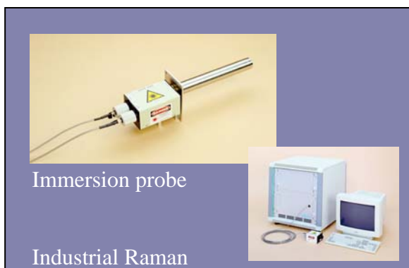
Figure 2 : Raman equipment

achieve optimum coupling to the analysed solution.