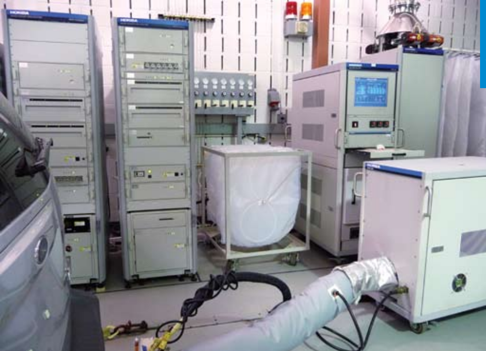
Exhaust test cell showing a Horiba BMD-1000 (at right), the collection bags (center), and the MEXA-7000 (left). In the foreground is the heated sampling pipe coming from the vehicle and entering the EXFM exhaust flow meter. Its measurement determines correct dilution.

specific deployment strategies are not yet clear, production applications are expected to arrive around the middle of the 2010 decade.