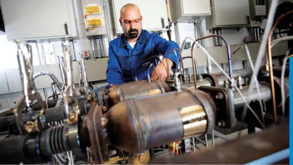
A BASF Catalysts technician sets up a catalyst long-term stress test in the laboratory. Future emissions regulations are expected to require greater catalyst durability.